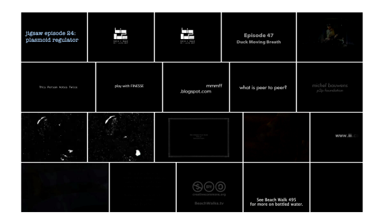
Figure 1. Sample of black frames from intros or outros being filtered from the final result list.

combined to a two-dimensional feature vector. Thereby, the size was normalized to mean 1 and standard deviation 0.75 (if no face was found, this feature was set to -1).