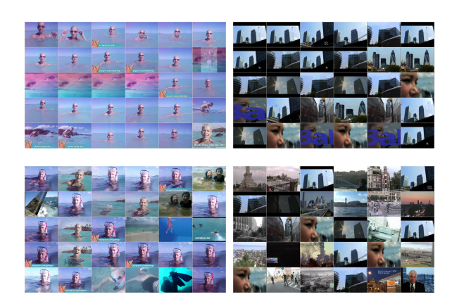
Figure 2. Top: Detection results for the concepts: "swimming" and "cityscape" for the TRECVID based detectors. Bottom: Samples of training material for the same concepts in the TRECVID dataset. Such redundancy in the dataset leads to an disadvantage for YouTube trained concept detectors.

In all cases, SVM scores were mapped to probability estimates using the LIBSVM standard implementation.