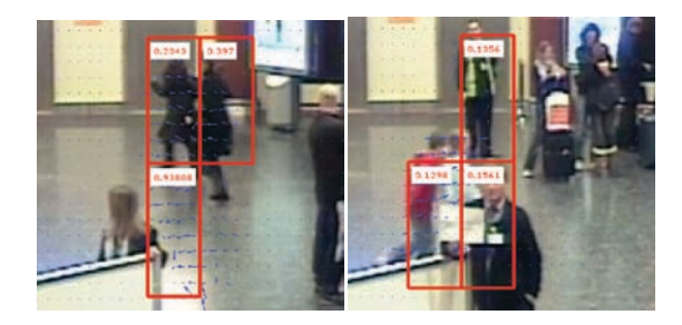
Figure 3: Examples of simultaneous events that are close to each other and therefore detected as a single event.