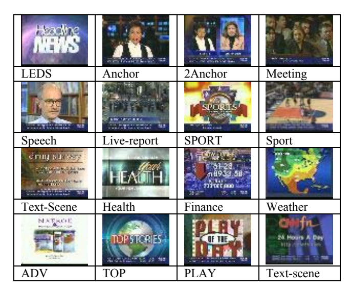
Figure 2: Examples of shot categories

For completeness, we also subdivided the sports story into substories depending on different types of sports. This is also a requirement of TRECVID for story segmentation task. Figure 2 shows examples of shot categories in our framework.