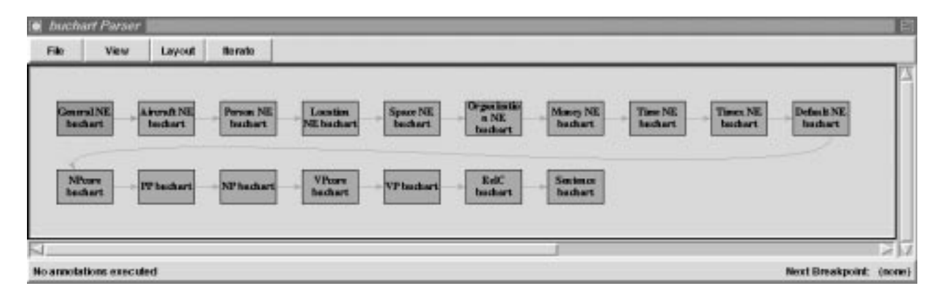
Figure 3: buchart Parser submodules

The main changes introduced for MUC-7 are a significantly enhanced grammar development environment, and a completely rewritten and extended grammar which now reflects a substantially different philosophy.