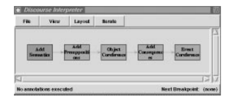
Figure 4: Discourse Interpreter submodules

processed in the following stages, illustrated by the submodules in the GATE interface shown in Figure 4, gradually specialising the Domain Model to become a Discourse Model, the final version of which is passed to the Template Writer.