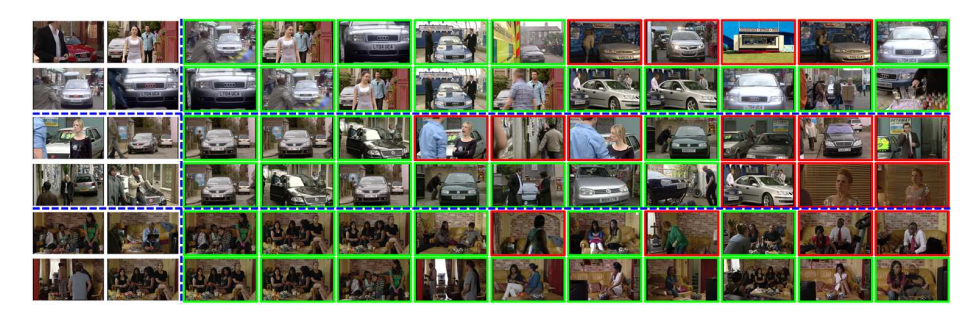
Fig. 3: Comparison of ranked lists on INS2013. Query objects are on the left side. On the right side, the top 10 returns are ranked from left to right: For each example, the upper and lower rows are returned by BL and M6 in Table 1, and the accuracies from top to bottom are 9.46 vs. 25.84, 20.71 vs. 32.37, and 31.21 vs. 65.35. Positive (negative) samples are marked with green (red) bounding boxes.

In this section, we introduce three improvements on the traditional spatial re-ranking method in three sub-sections, respectively. We also analyze the rationality of each part by comparison experiments, as shown in Table 1. Figure 3 illustrate the advantage of our proposed re-ranking method by comparing it with the baseline in Subsection 2.2.