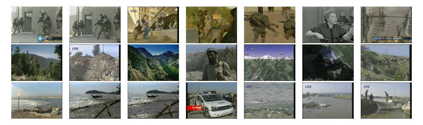
Figure 9: Example of queries using the "texture expansion". The query image is shown on the left-hand side, with the results following. From the top row, the queries are military , mountain and water .