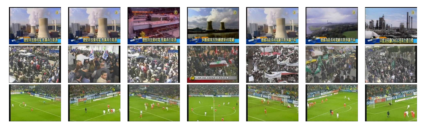
Figure 10: Examples of queries using the "colour expansion". The query image is shown on the left-hand side, with the results following. From the top row, the queries are chimney , demonstration and football .