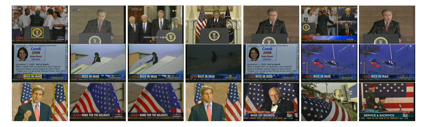
Figure 8: Examples of querying using "Video Google". The query image is shown on the left, with the query object outlined in yellow, and the returned ranked keyframes follow. Top row: search on the presidential seal. The 1st, 3rd, 4th, 7th, 8th and 9th results are shown; second row: search on the words "RICE IN IRAQ". The top 6 results are shown; Bottom row: search on part of the us flag. The 1st, 2nd, 3rd, 4th, 6th and 7th results are shown.