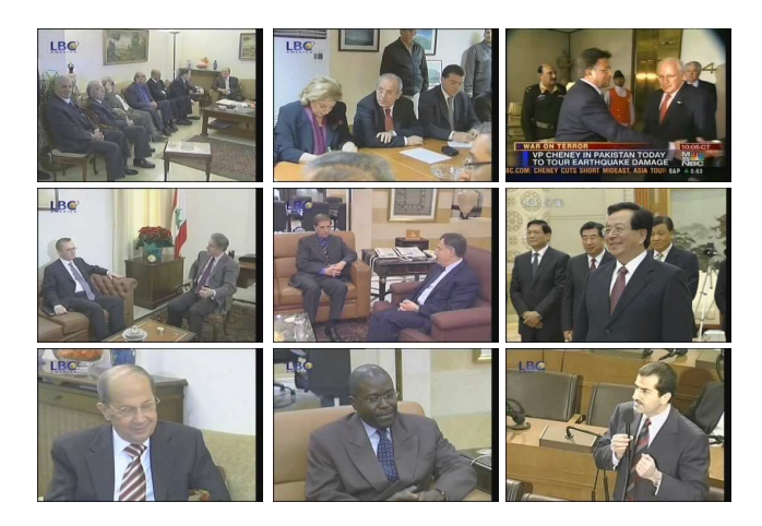
Figure 4: Examples of scene matching (section 1.2) for the concept "government leaders". Spatial layout is important for such cases as people are often framed in a common manner/pose for single individuals, pairs, small groups etc.

non-increasing order over a weighted sum of the votes, where the weights quantify some measure of relative confidence between the multiple sources. The weightings are determined from a validation set, taken from the training data, for each concept.