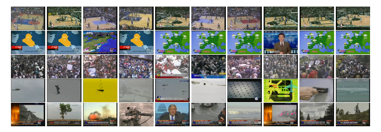
Figure 2: Example of bag of visual words classification (section 1.1): top ten results for basketball, maps, crowd, airplane, and military concepts.