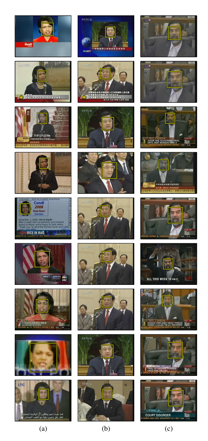
Figure 7: The top 9 ranked shots retrieved from the entire TRECVID 2006 test collection for query on (a) "Condoleezza Rice", (b) "Hu Jintao", (c) "Saddam Hussein". Each shot is shown by the best ranked face detection within the shot. The TRECVID 2006 test collection is represented by about 23,000 close to frontal faces, detected in both the representative and non-representative keyframes. The top 100 ranked shots contain 13, 25 and 90 correctly retrieved shots for (a), (b) and (c) respectively. Building a face based person X detector on the fly provides a starting point for the interactive search. See text (section 2.1).

Some of the queries in a TRECVID interactive session can be partially answered by using real-time search for specific objects over the corpus. The object used for search can be directly or indirectly related to the actual query. For example, to find George Bush, one could try and search for the presidential seal, often seen on the lectern at presidential press conferences (see figure 8). Another example might be to search for the NBA logo to find basketball matches. Here