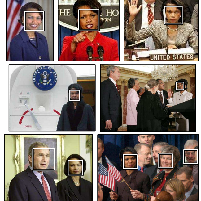
Figure 5: Example images with frontal face detections overlaid returned by Google image search queried for "Condoleezza Rice". Note that downloaded images may contain faces of other people. In our interactive search application the user is presented with all detected faces and manually labels 20-200 positive face exemplars containing the person of interest. For this example query, we downloaded 783 images containing 299 frontal face detections of which 190 were images of Condoleezza Rice.

This section describes our approach to search for specific people in the video (person X detection) using their imaged face appearance [14, 26, 30]. This is implemented by training an SVM classifier on descriptors extracted from (close to) frontal face detections. The positive training data is obtained using Internet image search. For example, we search for "Condoleezza Rice" using Google Image search and obtain hundreds of images containing her face. Exam-